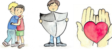
Forgiveness Courage Hope Compassion Respect Responsibility